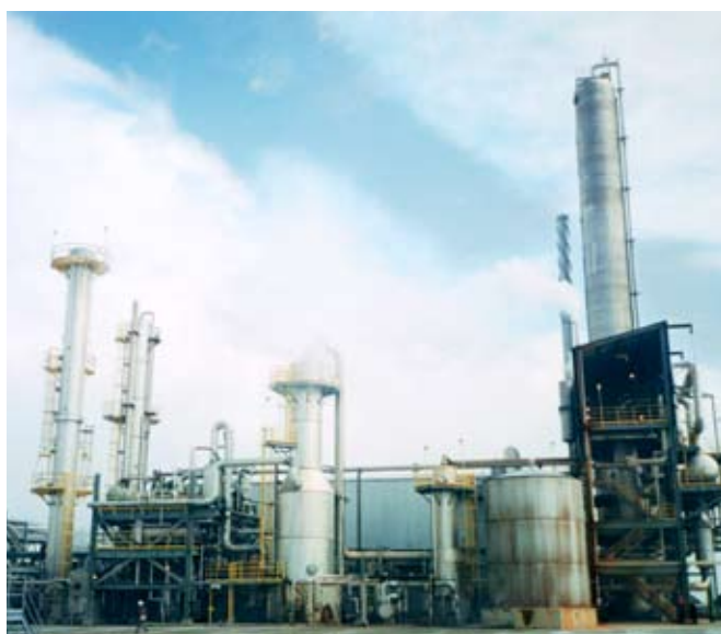
An integrated UAN facility.